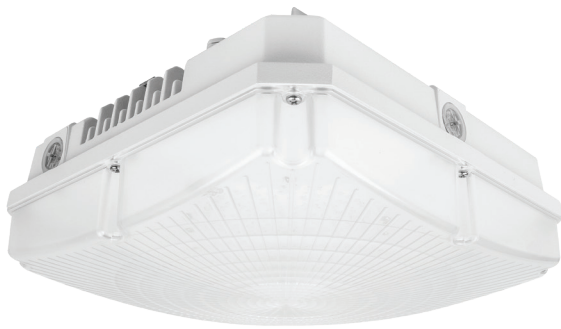
shown in white