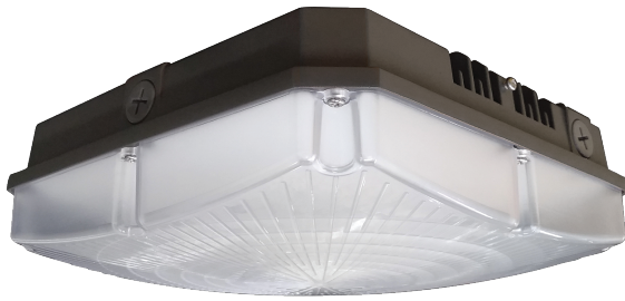
shown in dark bronze