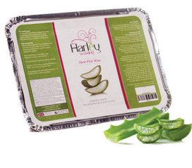
Aloe Hard Wax