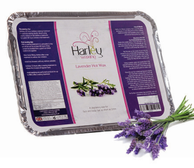
Lavender Hard Wax