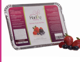
Summer Fruits Hard Wax

For the best possible results when preparing the skin before waxing. It is essential to use Harley Pre-Oil and post products, either the After Care Oil or our Aloe Soothing Gel.