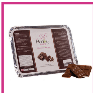
Chocolate Hard Wax