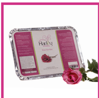
Rose Hard Wax

To ensure an extra gentle removal, it is essential that Harley Pre Waxing Oil is applied prior to the application of the wax. The Pre-wax oil is specifically formulated so that it coats the skin and not the hairs allowing the wax to only adhere to the hairs and not the actual skin. This allows for a more thorough and comfortable waxing experience.