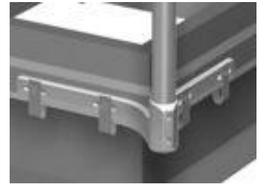
Counter Flashing Mounting

If mounting on the roof curb, abide by industry standards for mounting, fastening and sealing KeeHatch brackets.