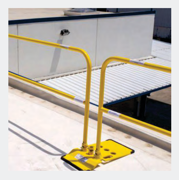
Durable TS-22 Coating