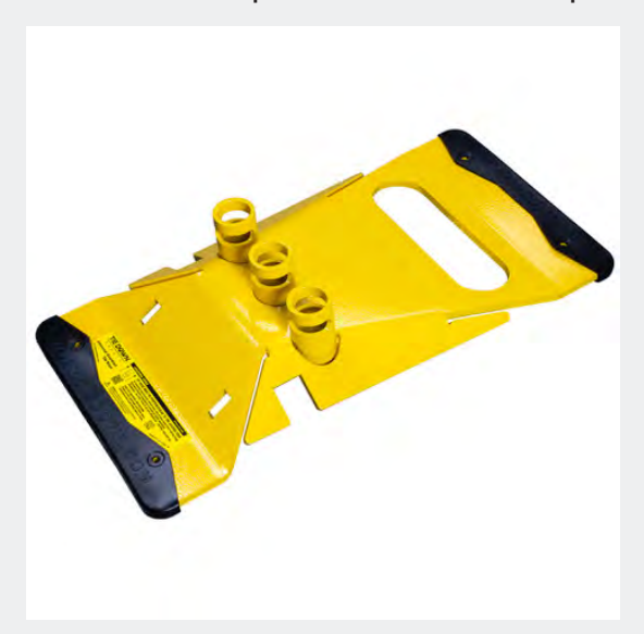
Lightweight 58 lb. Bases

NextGen 3000™ Universal Guardrail is a state-of-the-art, non-penetrating, modular rooftop safety railing system. Due to its patented engineering and design, NextGen 3000 outperforms all other roof fall protection systems. When force is applied to the top safety rail the lightweight, easy to carry, 58-pound bases drive the load downward and grip into the roof. This enables the safety rail system to meet OSHA requirements while not penetrating the roof membrane. Installation is fast and easy.