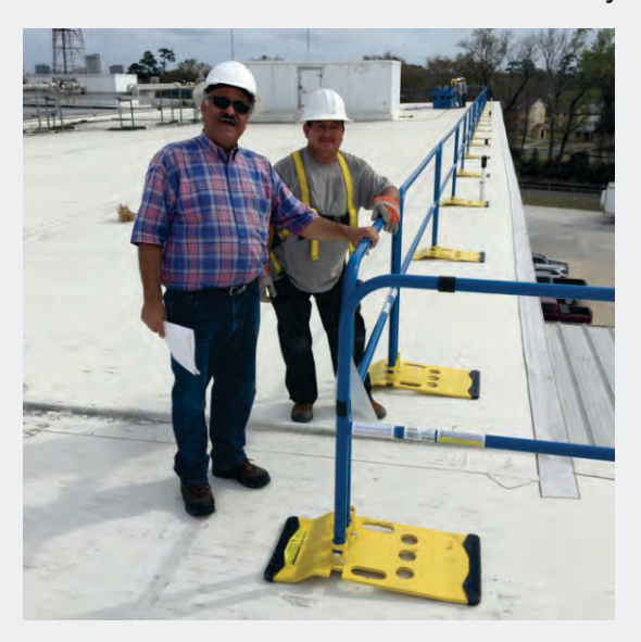
15 Standard Colors to Choose