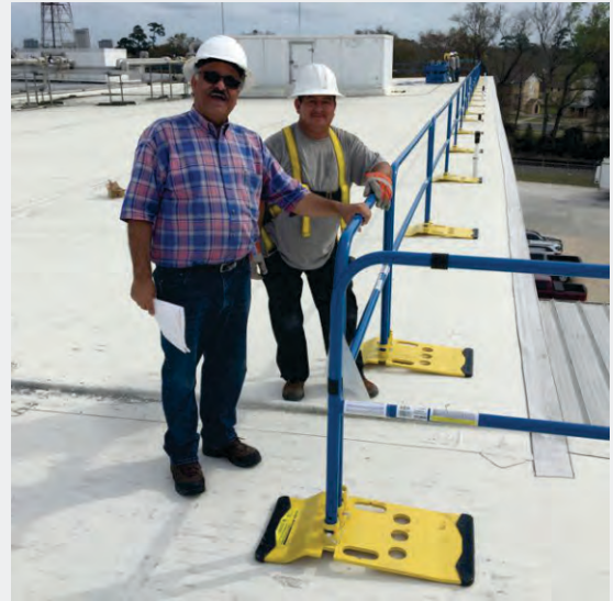
15 Standard Colors to Choose