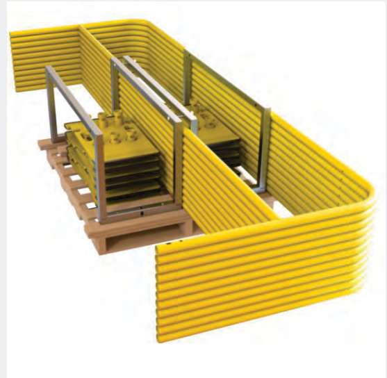
Stack Pallet Shipping