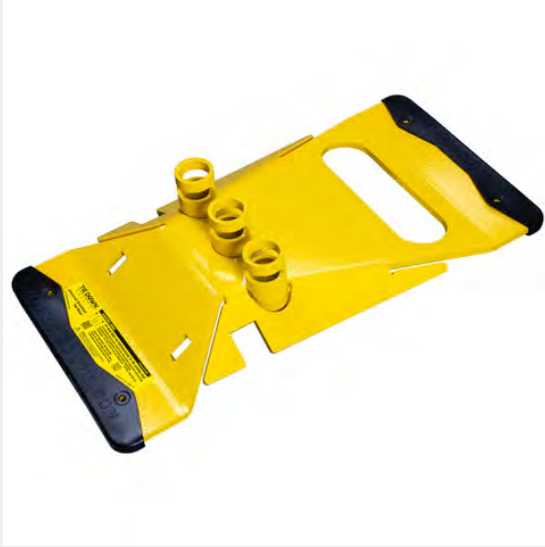
Lightweight 58 lb. Bases

NextGen 3000™ Universal Guardrail is a state-of-the-art, non-penetrating, modular rooftop safety railing system. Due to its patented engineering and design, NextGen 3000 outperforms all other roof fall protection systems. When force is applied to the top safety rail the lightweight, easy to carry, 58-pound bases drive the load downward and grip into the roof. This enables the safety rail system to meet OSHA requirements while not penetrating the roof membrane. Installation is fast and easy.