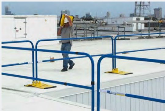
Roof Edge Railing