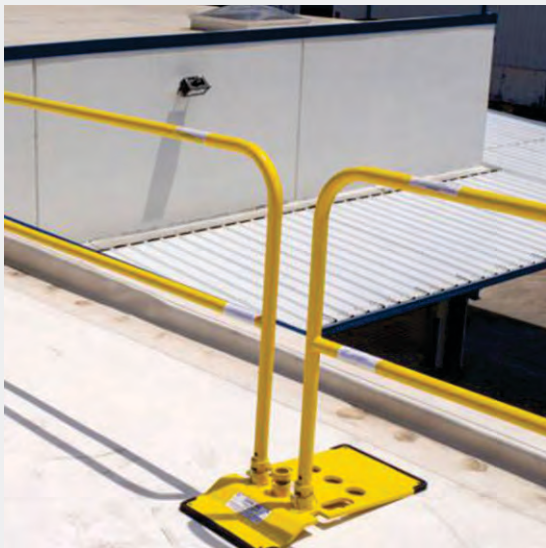
Durable TS-22 Coating