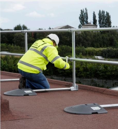
Hex Key For Easy Install