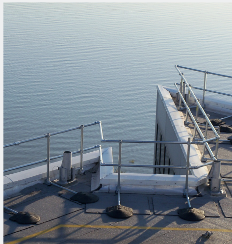
Fits any Roof Edge Design