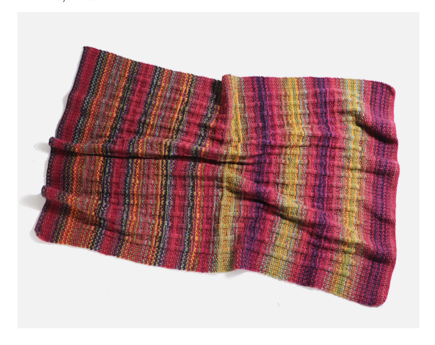
ITEM B: Flatlay of Blanket

Weave in all ends and stretch gently into shape.