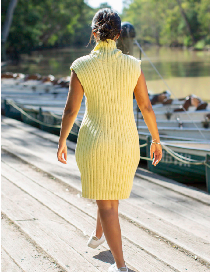
ITEM B: Back of dress with dart detail