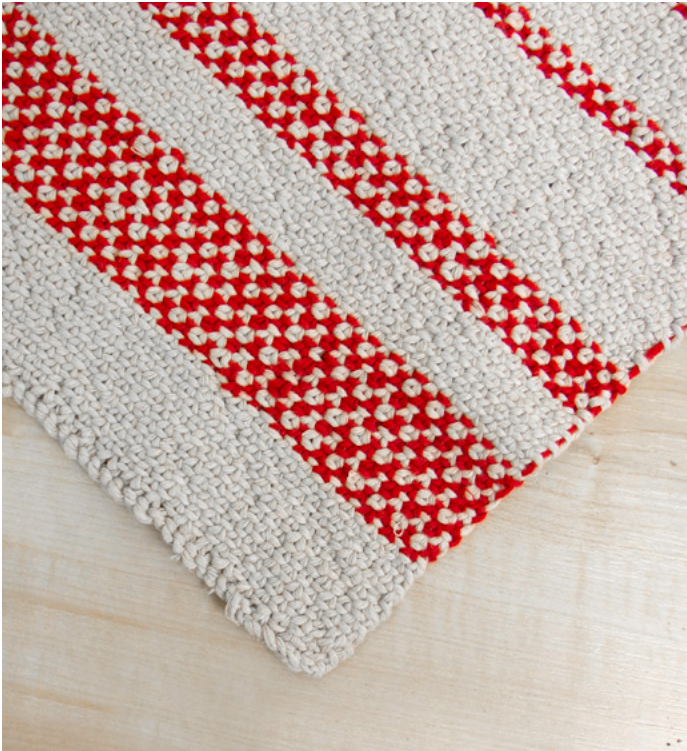
ITEM B: Linen Stitch Detail for Kitchen Towel