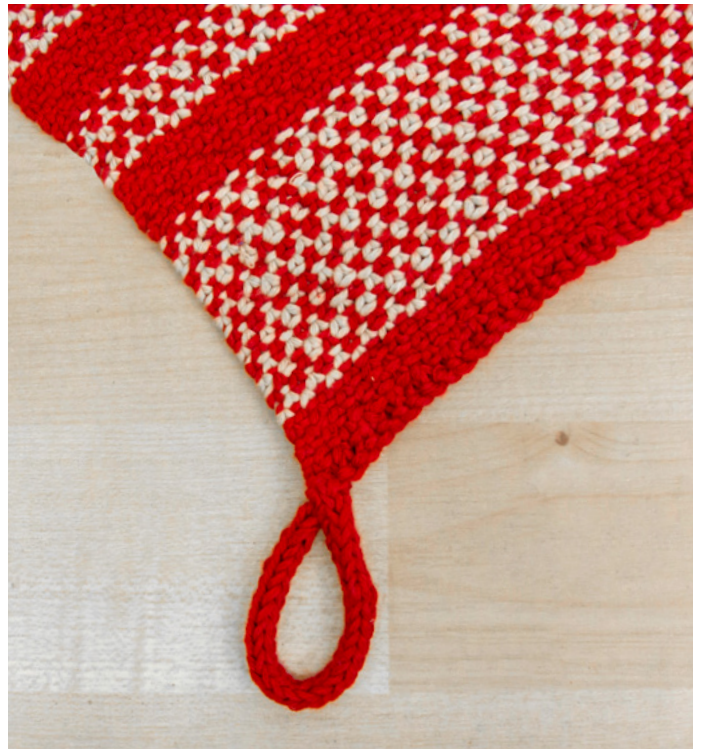
ITEM C: Loop Detail