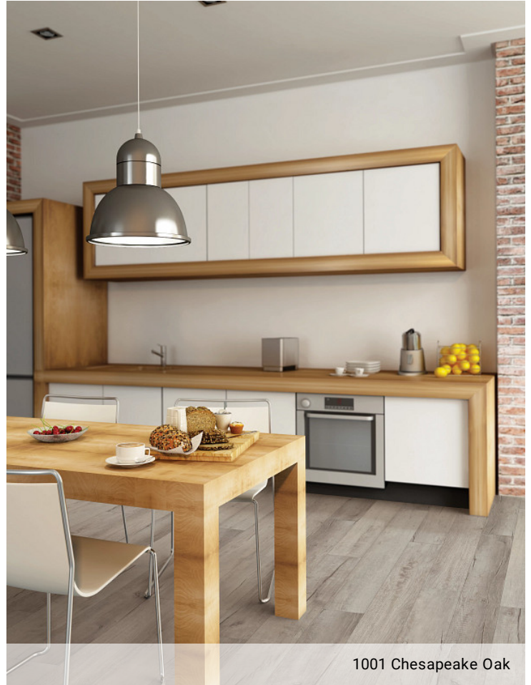
1001 Chesapeake Oak