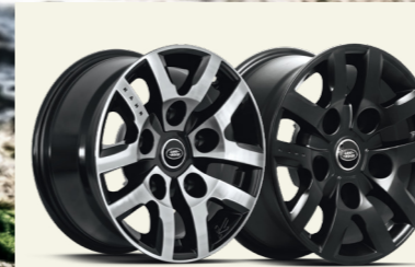
1948 DEFEND 8"x16" Diamond Cut - £1,050 (Set of 4) Satin Black - £950 (Set of 4)