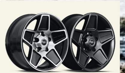
MONDIAL 9"x20" Diamond Cut - £1,280 (Set of 4) Satin Black - £1,280 (Set of 4)