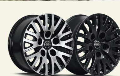
1983 RS DEFEND 8"x18" Diamond Cut - £1,198 (Set of 4) Satin Black - £1,150 (Set of 4)