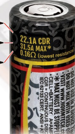
cell = battery; amperage = discharge