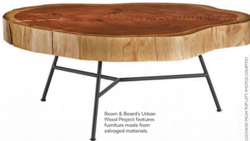
Room & Board's Urban Wood Project features furniture made from salvaged materials.

Minneapolis-based furniture company Room & Board ( roomandboard.com ) underlined its commitment to both American craftsmanship and the beauty of our vast acreage with the launch of its Urban Woods Project, which reimagines materials destined for landfills as beautiful pieces for the home. Now, in conjunction with Sacramento Tree Foundation and Wood From the Hood, it has expanded the program to the West Coast. Wood slices from redwoods found along Sacramento's Truxel Road and English walnut trees harvested from Wheatland, Calif., have been turned into furniture with a carbon savings equivalent to keeping a car off the road for over two and a half years. Now that's driving home a message! —AS