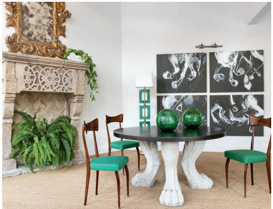
TABLE MATTERS DESIGNING WOMEN

What's ahead for spring? A new studio where I can develop concepts, glazes and work with outside potters. And fresh designs. One is a piece that fell. Rather than think it was ruined, I set it on its side and now the flower goes in diagonally. It's called the Hope vase.