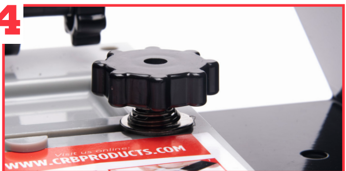
Now mount two of the Rod Stands to the AHWS Base. Align the rear hole on the rod stand with the bottom slot on the AHWS Base and slide a Rod Stand Bolt through both pieces. Secure by installing a steel washer, conical spring, washer, and locking knob in that order starting from the base.