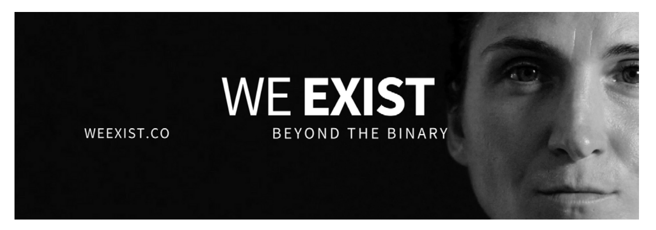
Part I - Getting Ready to Watch the Film: An Anticipation Guide

The film you are about to see, "We Exist: Beyond the Binary" is an account of a gender non-binary person's experience. Through their story growing up as well as interviews with their family, other non-binary individuals and medical professionals, We Exist paints a picture of the gender binary and what it is like to exist outside of it.