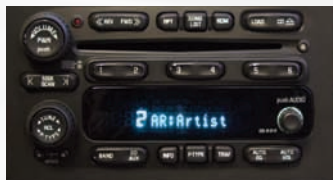
Factory Radio Not Included