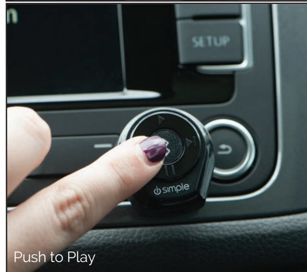
Push to Play