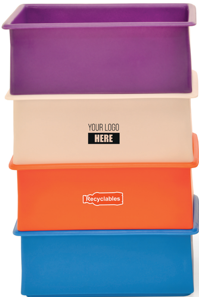
Container shown X402 Kleena-Stack

Part of the Euro size interstacking range of containers, including lids and dollies