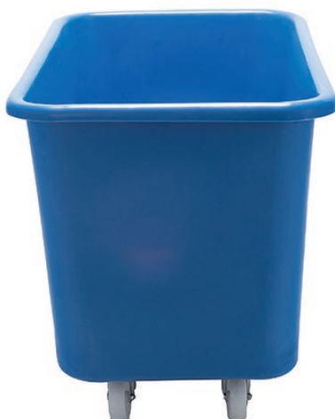
Short wall view