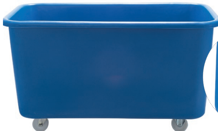
Long wall view