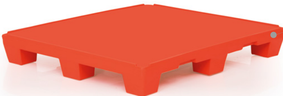
4 way entry - 4 open sided pallet