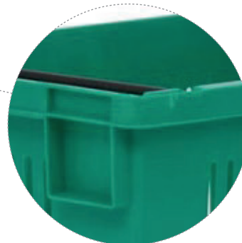
M716 SN BALE ARM