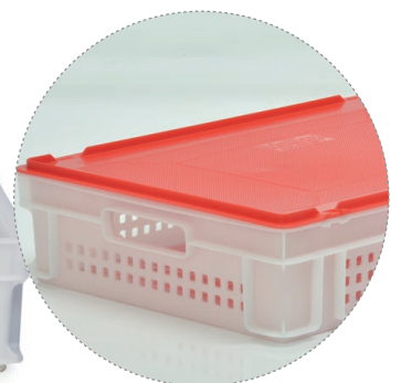
OPTIONAL DROP-ON LID M213