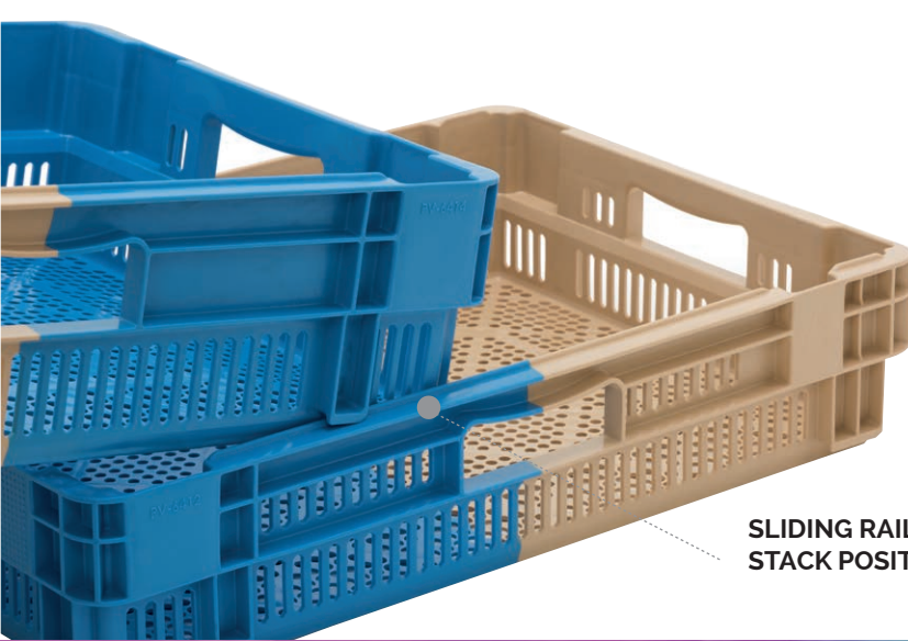
SLIDING RAILS FOR EASY STACK POSITION LOCATION

Mailbox designs and manufactures one of the widest ranges of materials handling solutions in Europe, with over 40 years' experience across a wide range of market sectors.