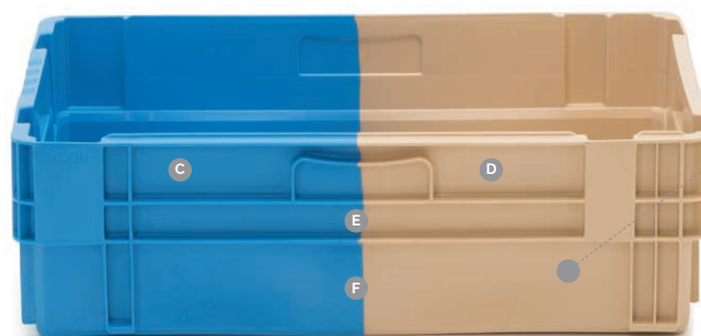
LONG WALL (both sides)

Short wall B - Ext stippled label area: 130mm (L) x 70mm (H)