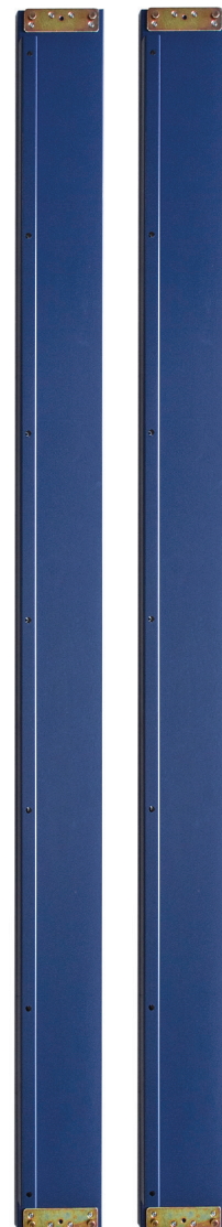
(2) Side Rails