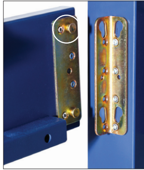
Male portion of the Metal Bed Bracket Hardware

Start by attaching your two siderails to the Headboard. The two male portions of the bracket are located on the Siderails. Align them with the female portion on the Headboard. Press down until it "clicks" into place.