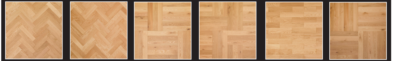
HERRINGBONE 3 1/4" X 14.68", 5" X 30"