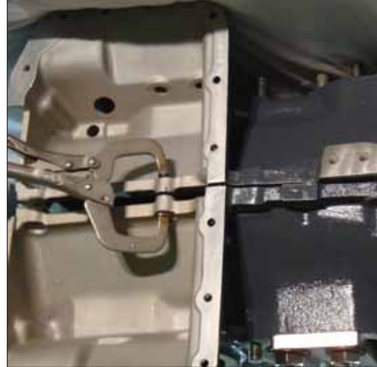
Fig. 9: A clamp can be used to keep the halves parallel during separation.

journal. This engine requires two symmetric plates.