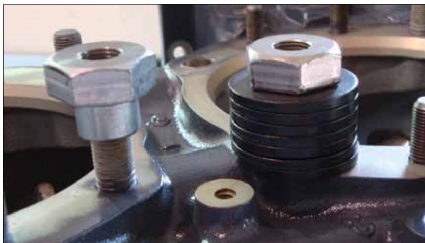
Fig. 2: A stack of washers can help remove the through bolts on a wide-deck engine.

If your engine is a wide-deck version, the through bolts that are not anchored to one side of the case can be removed first. This is done by threading a nut onto the through bolt with a stack of washers under the nut (Fig. 2). The nut that we use has a longer length than the standard cylinder hold down nuts. This gives us more thread engagement to prevent wearing the through bolt threads. As the through bolt is withdrawn, the stack of washers must be increased in height. All eight of the through bolts on a six-cylinder engine can be removed in this way. The front four through bolts on a four-cylinder