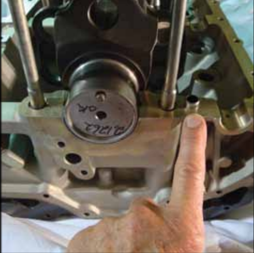
Fig. 7: The case will tend to rotate around these pins during separation.