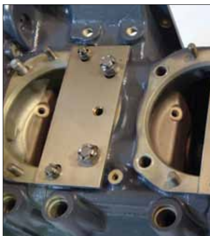
Fig. 11: Another special configuration is used if there is no crankshaft in the case.