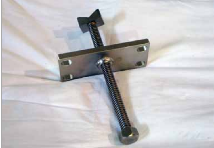
Fig. 4: The Acme screw with a V-block on the end to push on the connecting rod journals.

engine can also be removed in this fashion. Removal of the through bolts greatly decreases the forces involved in splitting the case apart.