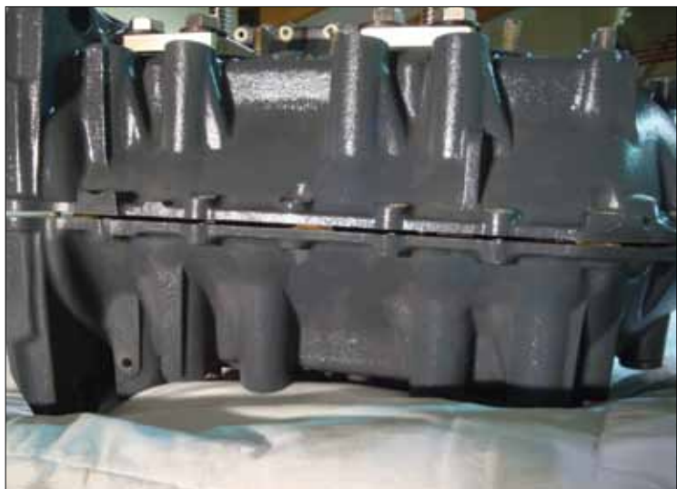
Fig. 6: Check parallelism in both directions.