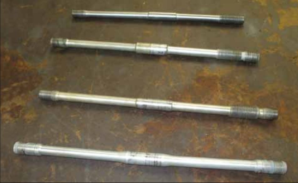
Fig. 1: Lycoming through bolts come in several different configurations.

wrench socket head cap screw). The diameter of the circle of bolts and studs that anchor each cylinder was slightly smaller on the narrow-deck versus the wide-deck engine. The through bolts on these engines were threaded into one side of the crankcase. Because they were anchored by being threaded into the case, they were referred to as “studs.”