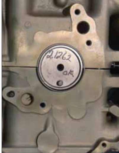
Fig. 8: An example of the case halves not staying parallel.