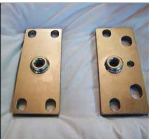
Fig. 10: Different plates need to be used for six-cylinder engines due to stud configuration.