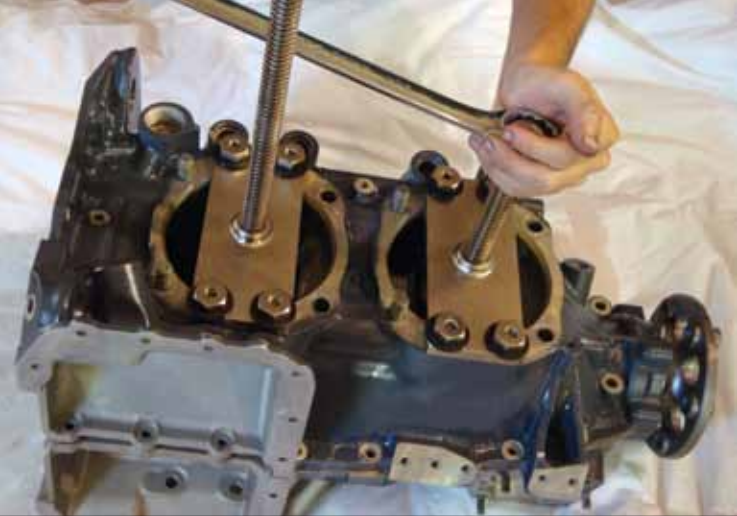
Fig. 3: Plates can be used over the cylinder base holes to provide anchors for the case-splitting screw.