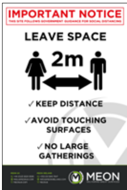
Product code: 112209 400mm x 600mm