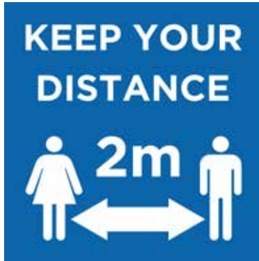
Product code: 343060 600mm x 600mm