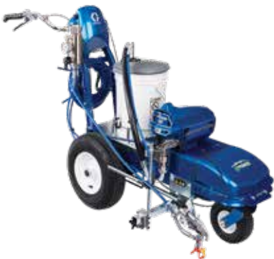
LineLazer ES 1000 240v c/w 1 battery & 1 gun Hire code: 940240 Sale code: 601406