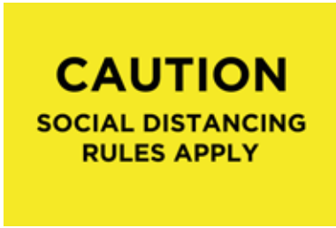
Product code: 343061 1500mm x 1000mm