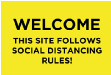
Product code: 343061 1500mm x 1000mm