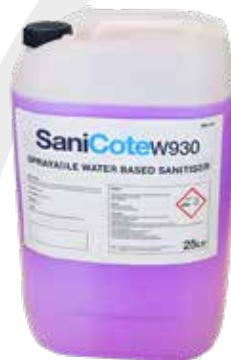
Product code: 601884 25 Litre Drum