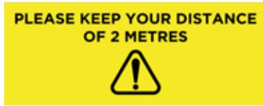
Product code: 343059 1200mm x 475mm