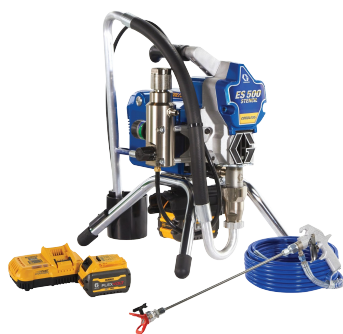
ES 500 STENCIL