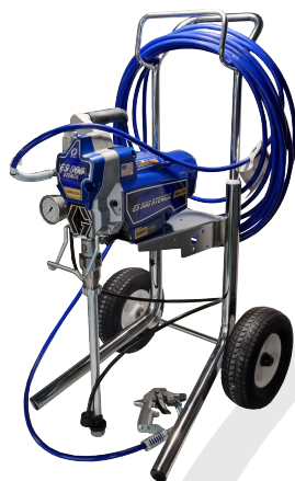
ES 500 STENCIL HI-BOY