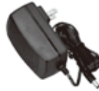
1x UL approval home adapter