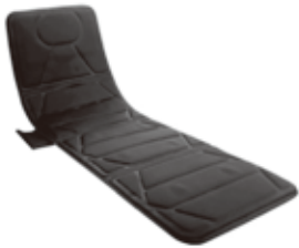
1x Ten Motors Massage Mattress