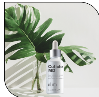
CUTICLE MD $24.50

The perfect finish to a pedicure, Gold Spritz contains a burst of shimmer to give your feet and legs a glamorous look and feel. Available in 260 ml (750 applications)