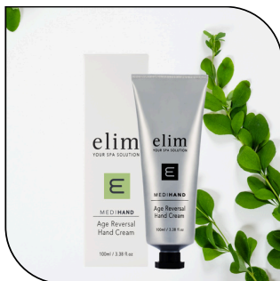
AGE REVERSAL HAND CREAM $47 SINGLE MSRP $95

NailFx is a powerful nail serum infused with natural active ingredients that fight bacterial and fungal infections. Available in 20 ml pipette dispenser format