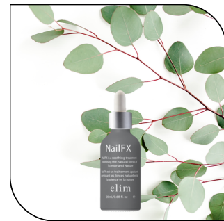
NAILFX $34 SINGLE $193 6-PACK MSRP $64

An antibacterial cuticle rescue with a blend of 10 oils to keep cuticles healthy. Available in 10 ml pipette dispenser format