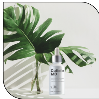
CUTICLE MD $17 SINGLE $96 6-PACK $190 12-PACK MSRP $32

The perfect finish to a pedicure, Gold Spritz contains a burst of shimmer to give your feet and legs a glamorous look and feel. Available in 100 ml