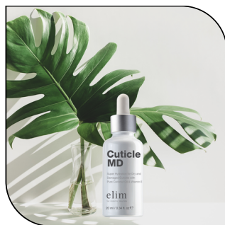
CUTICLE MD $24.50

A hydrating treatment that restores moisture and fights the signs of aging. Available in 450 ml format (180 applications)