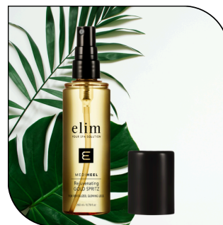
GOLD SPRITZ $55

An antibacterial cuticle rescue with a blend of 10 oils to keep cuticles healthy. Available in 20 ml pipette dispenser format (40 applications)