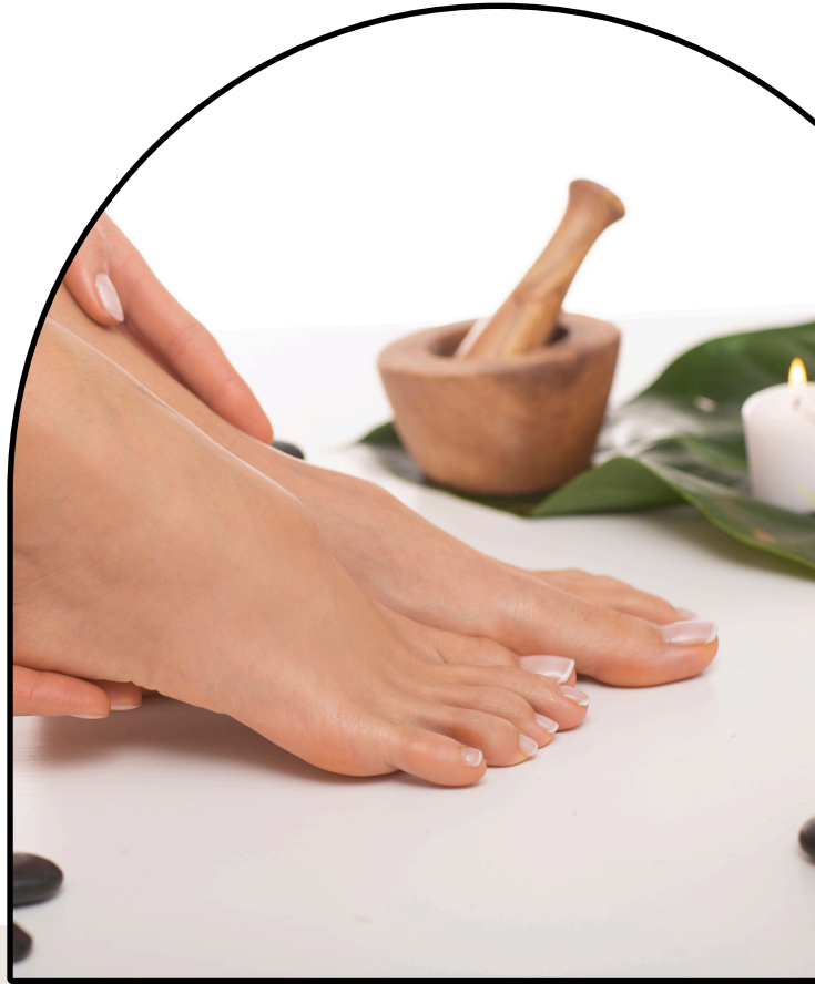
Cost/Service summary for services with Elim Professional products

We can assist spas in creating a signature treatment with retail and marketing support available.