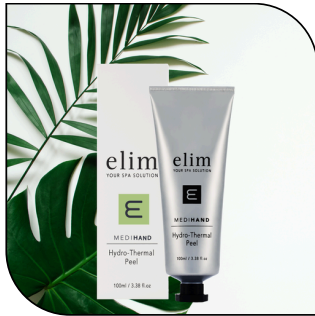
HYDRO THERMAL EXFOLIANT $30.50 SINGLE $173.85 6-PACK MSRP $58

A pH-balancing daily exfoliator with heating actives to enhance absorption of anti-aging ingredients. Available in 100 ml tube