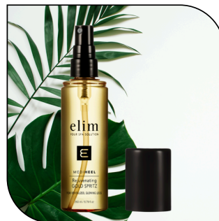
GOLD SPRITZ $55

A massage cream that moisturizes skin and smoothen fine lines. Available in 300 ml and 500 ml formats (60 and 100 applications)