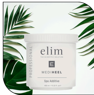
SPA ADDITIVE $64

Exfoliate with a combination of glycolic and lactic acids. Available in 300ml and 500 ml formats (60 and 100 applications)