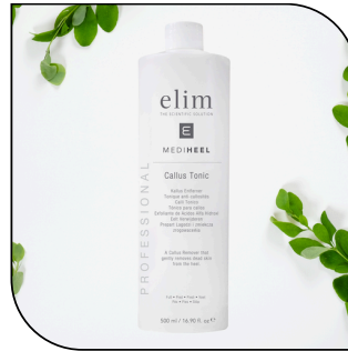
CALLUS TONIC $50/$73/132

Formulated to effectively clean skin Available in 250 ml spray bottle