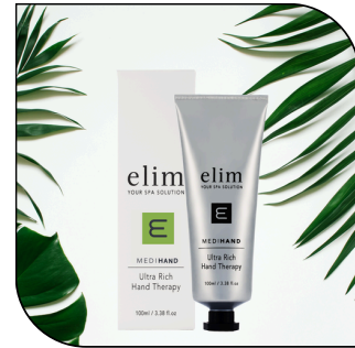
ULTRA RICH HAND THERAPY $30.50 SINGLE $173.85 6-PACK MSRP $58

Brighten and whiten aging and discoloured nails. Available in 80 ml tube