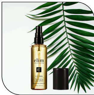
GOLD SPRITZ $28 SINGLE $159.60 6-PACK $319 12-PACK MSRP $53

A hydrating treatment that restores moisture and fights the signs of aging. Available in 100 ml format