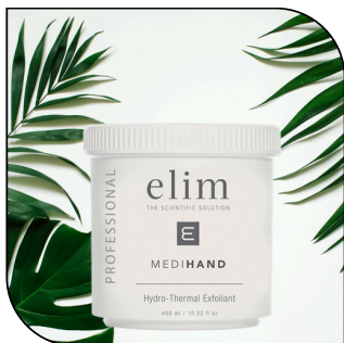
HYDRO THERMAL EXFOLIANT $115.50/$90

A pH-balancing daily exfoliator with heating actives to enhance absorption of anti-aging ingredients. Available in 450 ml tub (90 applications) and 300 ml tube (60 applications)