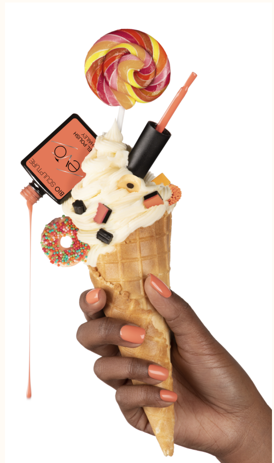
Model is wearing Evo Hailey