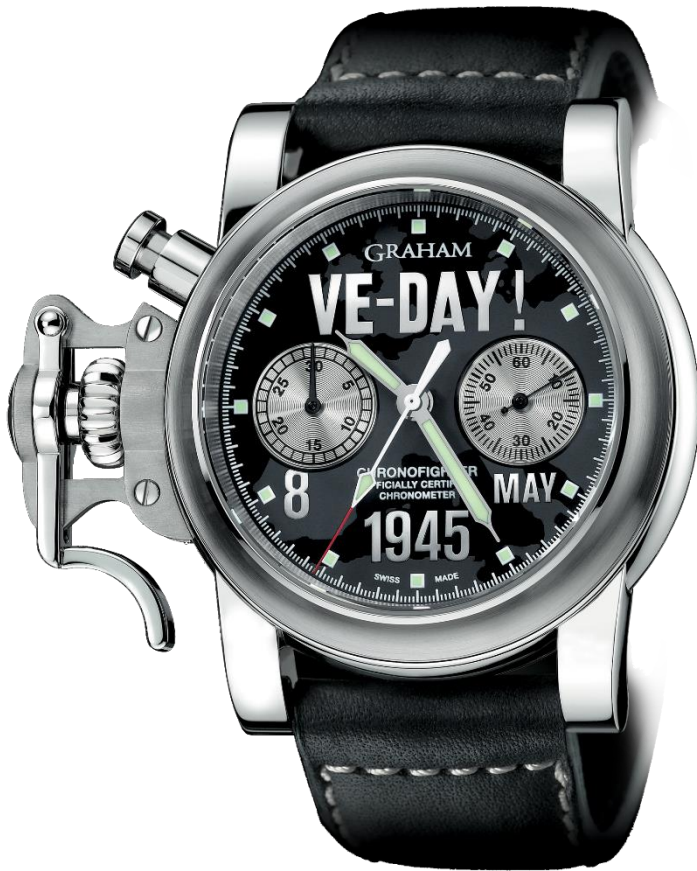
Original Chronofighter VE-Day model

Graham celebrates the 25th anniversary of its creation by reviving the Chronofighter VE-Day model. The VE-Day model was launched initially in 2005 to commemorate the 60 th Anniversary of the landmark date. Today it is reedited to celebrate both the 75 th Anniversary of VE-Day and the 25 th Anniversary of the brand