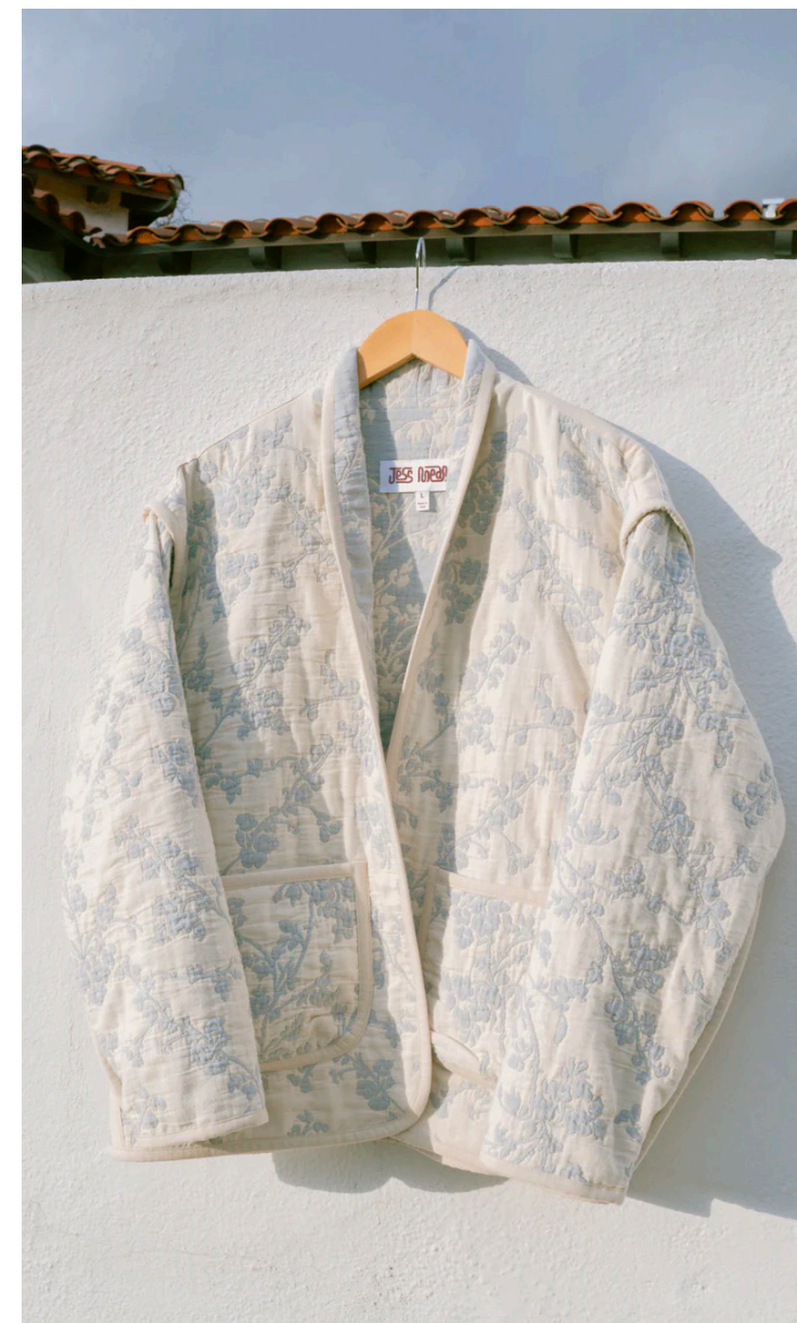
JUNIPER CROPPED COAT NOVA, CORNFLOWER, LINEN, BELLFLOWER XXS, XS, S, M, L, XL, XXL WHOLESALE: $255 SUGGESTED RETAIL: $510