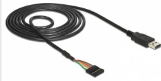
ca. 1,8 m