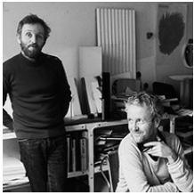
Ronan & Erwan Bouroullec

Ronan Bouroullec (born 1971) and Erwan Bouroullec (born 1976) have been working together for about twenty years now. Their collaboration is a permanent dialogue nourished by their distinct personalities and a shared notion of diligence with the intention to reach more balance and fineness. Their work has covered many fields ranging from the design of small objects as jewellery to spatial arrangements and architecture, from craftsmanship to industrial scale, from drawings to videos and photography. They have collaborated with leading design companies such as Vitra, Cassina, Artek, Danskina, Magis, Alessi, Galerie kreoo, Established & Sons, Axor Hansgrohe, Flos, Kvadrat, Glas Italia, Kartell, Kettal, Iittala, Cappellini, Ligne Roset, Nani Marquina, Mattiazzi, Mutina, Samsung and Hay. Designs of Ronan & Erwan Bouroullec are part of select international museums' permanent collections and several exhibitions have been devoted to their work including the Design Museum, London, the Museum of Contemporary Art, Los Angeles, the Centre Pompidou Metz, the Museum of Contemporary Art, Chicago, the Musée des Arts Décoratifs in Paris, the Vitra Design Museum or the FRAC Bretagne. The Bouroullec studio is located in Paris, and the whole team numbers around eight people. To discover more about Ronan & Erwan Bouroullec's work, please visit www.bouroullec.com