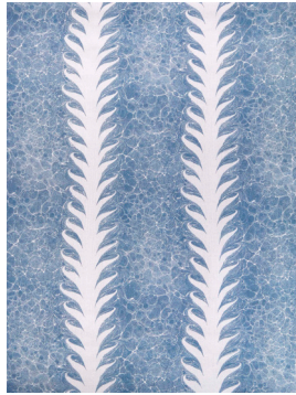
SKY BLUE/PLASTER (FABPMDSBP)