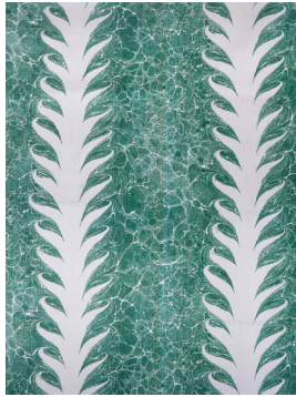
SEA GREEN/CHALK (FABPMDSGC)