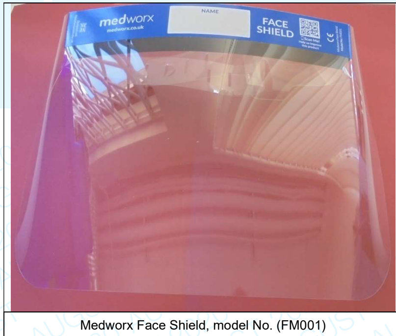
Medworx Face Shield, model No. (FM001)