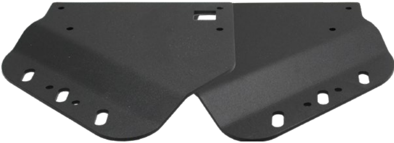
Vehicle Specific Fog Lighting Brackets Visit www.visionxusa.com to see full range.