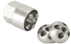
SECURITY NUT Available in multiple sizes