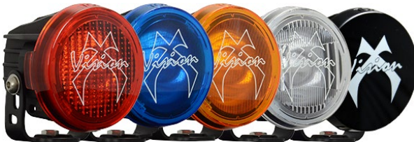
COVERS Comes in a variety of colors and beam patterns