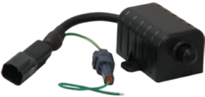
Part # - 4009257 Item # - XIL-PDIMMER Dial Knob Dimmer to Adjust the Light Output of Prime Drive Anywhere in Between 100% and 50%