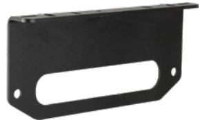
Part # - 9892313 Item # - XIL-WINCH6 Light Bar Winch Fairlead 6" Bracket (Available in 10")