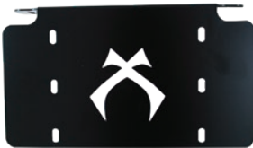
Part # - 4000308 Item # - XIL-LICENSEP License Plate Bracket for Lights up to 20"