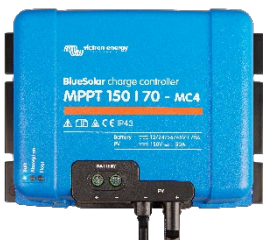
Solar Charge Controller MPPT 150/70-MC4