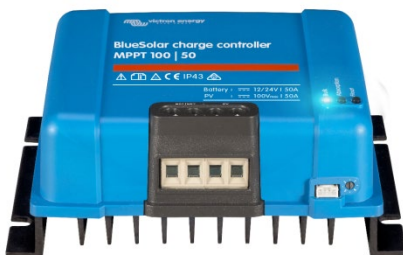
BlueSolar Charge Controller MPPT 100/50