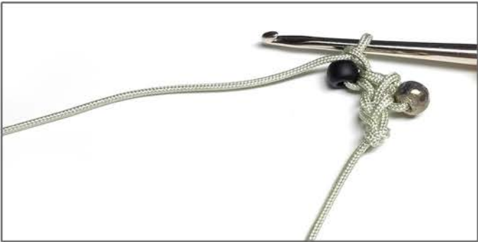
8) Slide a bead and chain around the bead.