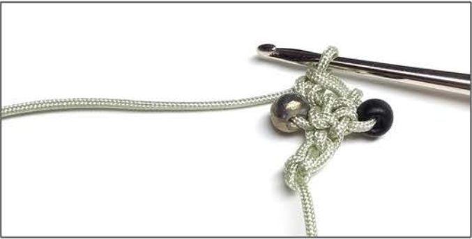
10) Single crochet at the 1st bead (insert hook on top, side loop of bead, yarn over and pull through, yarn over and pull through both loops).