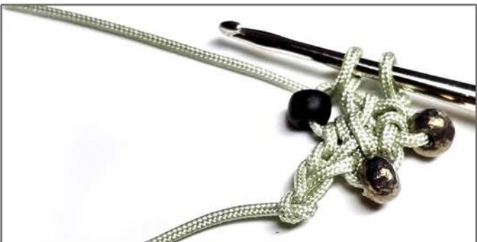
12) Turn the work over and single crochet in the top, side loop of previous bead.