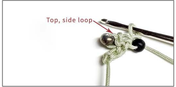
9) Turn the work over.