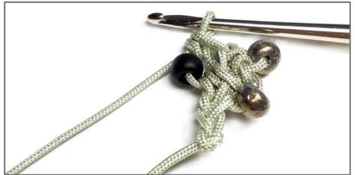
13) Single crochet is complete - one loop remaining on hook.