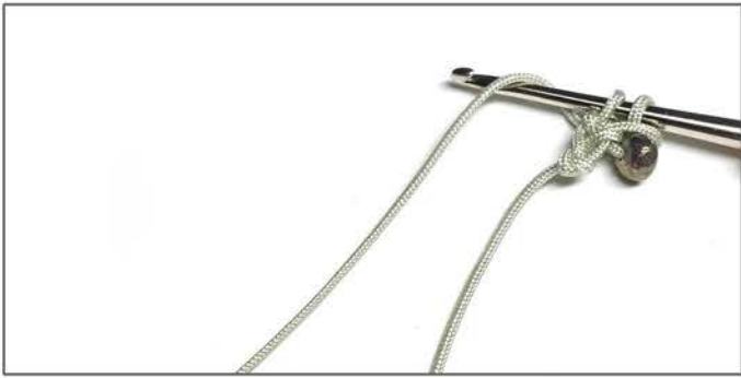
6) Yarn over again and pull through both loops.