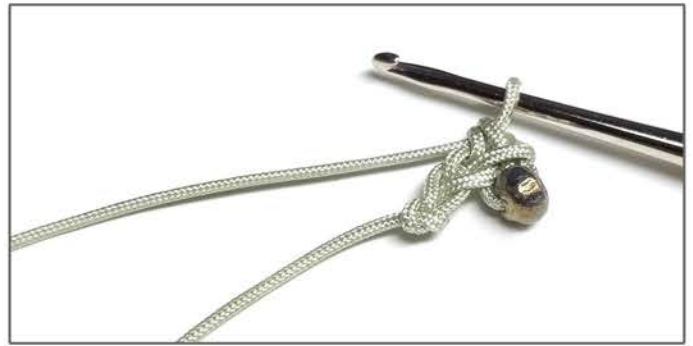
7) One loop remains - a single crochet is complete.