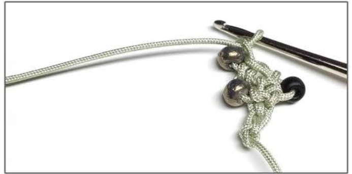
11) Slide another bead down and chain stitch around the bead.