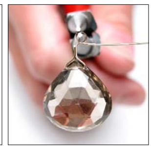
Step 10 Continue bending the wire around the bottom plier tip.