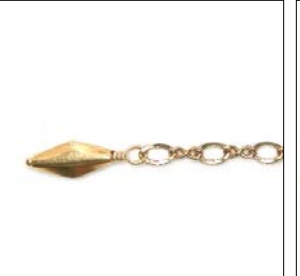
Step 12 Attach a single bead to the other end of the chain.