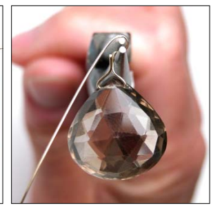
Step 8 Bring the end of the wire up and over the top plier tip.

Step 7a) Switch to the round-nose pliers.b) Place the tips of the pliers above and below the longer wire, at the right angle.