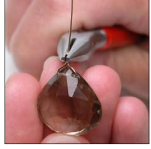
Step 5 Using the needlenose chain pliers grab both wires above the triangle.