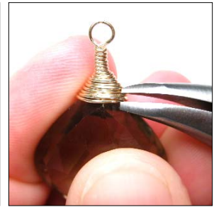
Step 14 Use the bent-nose chain pliers to gently tuck the end under the wire-wrapped cap.