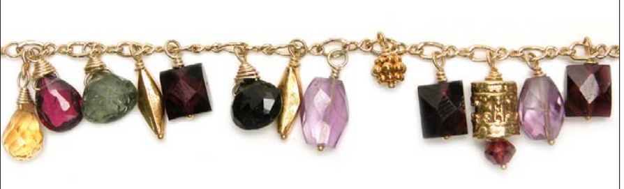
Step 15 Wire-wrap the bead onto the link so that it hangs downwards.