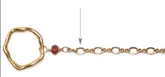
Step 13 Find the first large link over from the wire-wrapped bead.