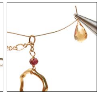
Step 14 Insert the headpin through the first large link of the chain.