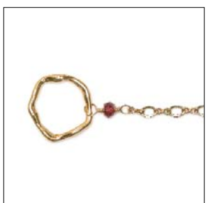
Step 11 Wrap the bead to the chain.

Wrap a bead to the jump ring and connect the the other end to the last link in the shorter of the two sections of chain.