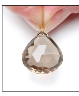
Step 2 Pinch both wires at the top of the briolette to form the shape of a triangle.

Step 1 a) Slip a briolette onto the wire. b) Leave 1/2" of the tail showing.