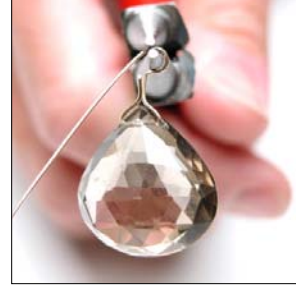
Step 9 Rotate the bottom plier tip to the top of the loop.