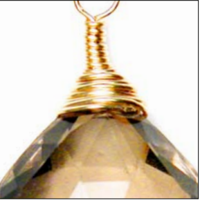
Step 15 This will help prevent the wire from snagging on clothing or hair.