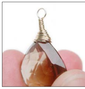
Step 13 Continue to wrap until you have run out of wire.