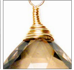
Step 15 This will help prevent the wire from snagging on clothing or hair.