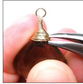
Step 14 Use the bent-nose chain pliers to gently tuck the end under the wire-wrapped cap.