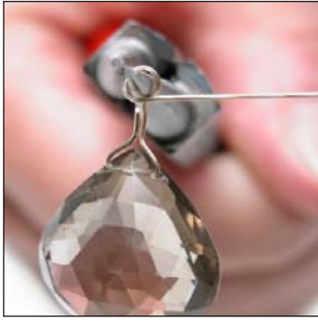
Step 11 When the circle is complete, center it above the briolette.