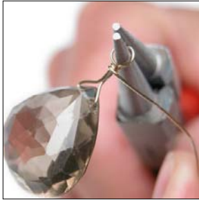
Step 12 Starting at the base of the loop, begin wrapping the longer wire in the space between the loop and top of the wire triangle.