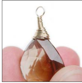
Step 13 Continue to wrap until you have run out of wire.