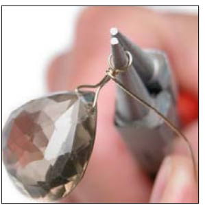
Step 12 Starting at the base of the loop, begin wrapping the longer wire in the space between the loop and top of the wire triangle.