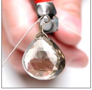
Step 9 Rotate the bottom plier tip to the top of the loop.