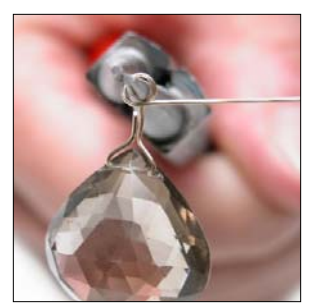
Step 11 When the circle is complete, center it above the briolette.