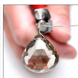
Step 10 Continue bending the wire around the bottom plier tip.