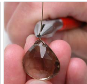
Step 5 Using the needlenose chain pliers grab both wires above the triangle.