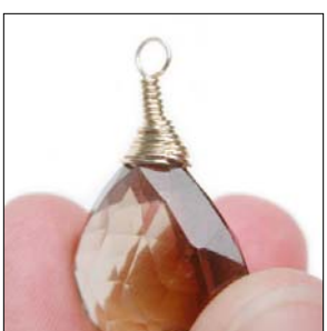
Step 13 Continue to wrap until you have run out of wire.