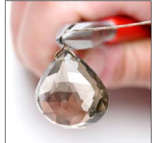
Step 6 Bend the longer wire into a right angle.