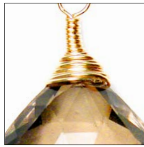
Step 15 This will help prevent the wire from snagging on clothing or hair.