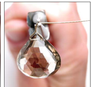
Step 7 a) Switch to the roundnose pliers.

b) Place the tips of the pliers above and below the longer wire, at the right angle.