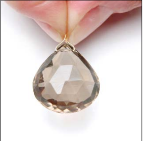
Step 2 Pinch both wires at the top of the briolette to form the shape of a triangle.