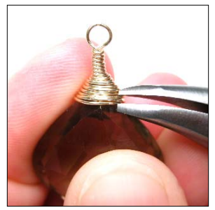
Step 14 Use the bent-nose chain pliers to gently tuck the end under the wire-wrapped cap.