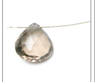
Step 1 a) Slip a briolette onto the wire. b) Leave 1/2" of the tail showing.