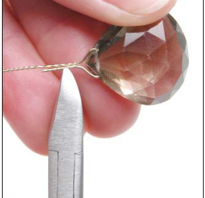
Step 4 Cut one wire 1/8" from the top of the wire triangle.