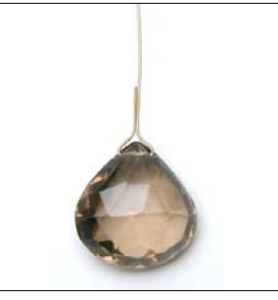
Step 3 Confirm that the briolette is centered inside the triangle.