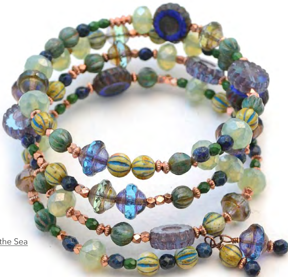
Into the Sea

In this week's episode, Patterning with Memory Wire, Kate and Emily dive deeper into the joys and pleasures of stringing on memory wire. And, though it's been around for more than fifty years, there seems to be new ways of using it: more sizes, more colors, and updated techniques. Follow the "Recipe for Success," if you want to open up your creative process. Or use the specific sample recipes at the end of the Notes. It's really impossible to pattern a "bad" design...Memory wire is so forgiving and it nets you fantastic results. So, happy beading!