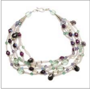
The completed necklace.