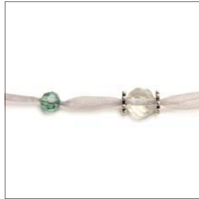
Step 7 Add another bead and leave it 3/4" apart from the first unit.