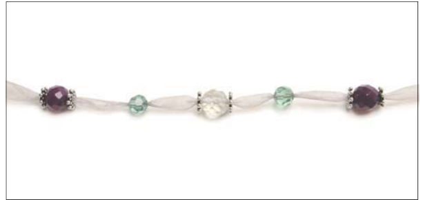
Step 8 Start adding more beads to one side and mirror the pattern on the other side.