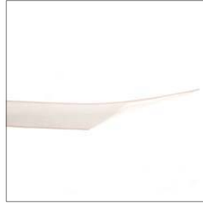
Step 3 This is call an "organza needle."