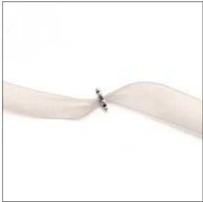
Step 5 Center the daisy spacer bead on the organza ribbon.