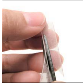
Step 2 Cut and taper to the opposite edge to create a needle shape.