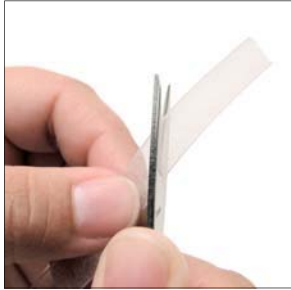
Step 1 Cut at an angle across the organza ribbon.