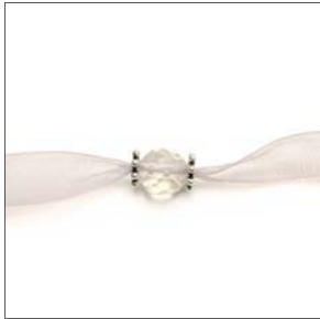
Step 6 String on a bead then another daisy spacer.