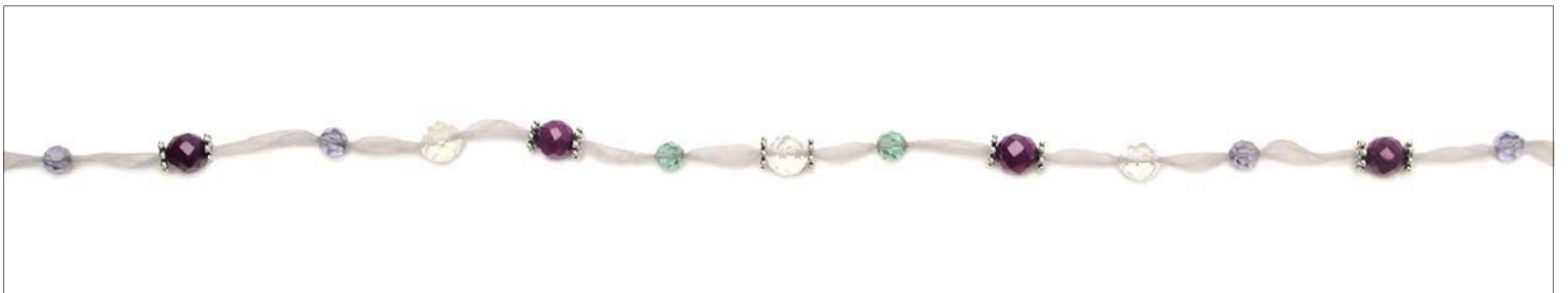
Step 9 Create about a foot of pattern on the organza ribbon.