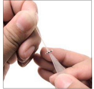
Step 4 String on a daisy spacer by using the "needle."