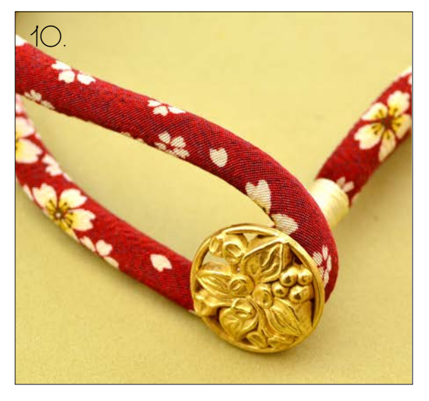
10. Find the center of the kimono cord and loop it around your button. Repeat Step 5 to tie a piece of temporary thread around the kimono cord.