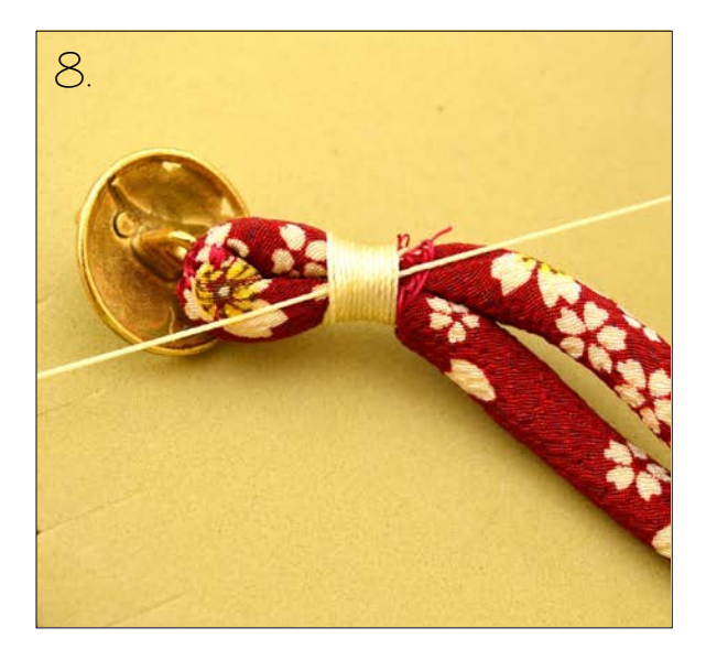
8. Pull the two tails of C-Lon away from each other until the middle of the loop moves into the center of the silk wrapping.