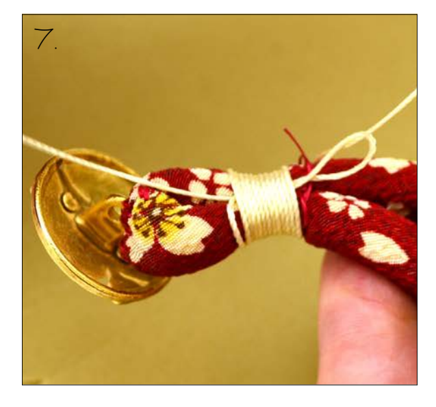
7. Make a silk wrap about 3/8 inch in length. Feed the tail of C-Lon through the loop.