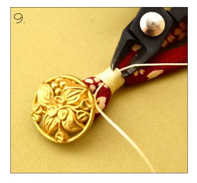
9. Carefully cut the ends of C-Lon. And at some point, cut away the temporary thread you positioned in Step 5.